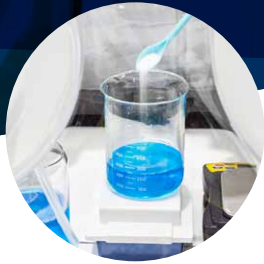
Disposable plastic tiles for balance stability