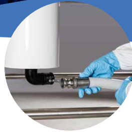
Dual stage H14 HEPA exhaust in incinerable housing