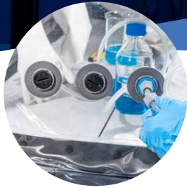
Gas tight peristaltic tube ports for product exit