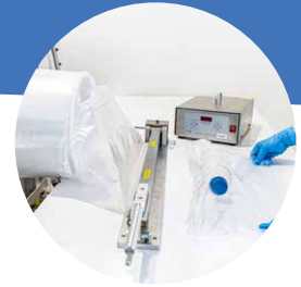
Dual weld / cut heat sealer to contain waste exit